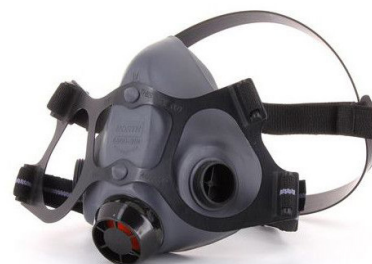
5500 Series Half Mask