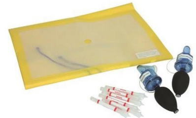
Qualitative Fit-Test Kit