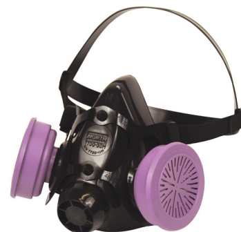
7700 Series Premium Silicone Half Mask