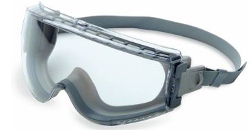
Uvex Stealth® Goggles