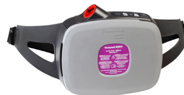
PRIMAIR® 700 Series PAPR