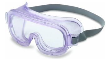
Uvex Classic – Economical Goggles