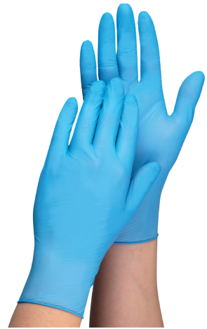
Nitrile Exam Gloves