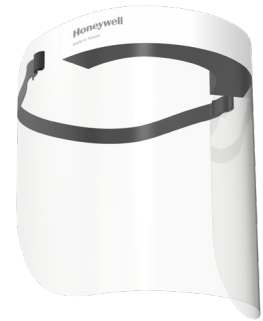
Disposable Face Shield