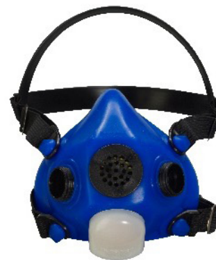
RU8500 Series Half Mask with Speech Diaphragm