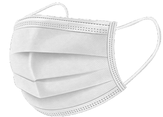
ASTM Level 2 Procedure Mask with Earloops