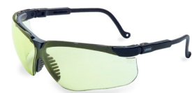
Uvex Genesis Protective Glasses