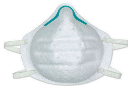
DC365 Surgical N95 Respirator