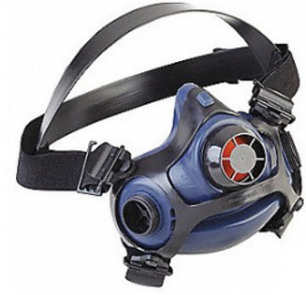
RU8800 Series Half Mask